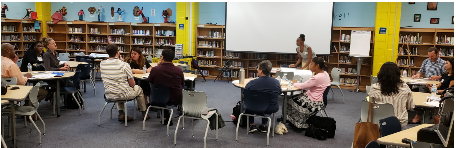
CAN DO Houston hosted a meeting with various partner organizations to coordinate efforts around improving safety, walkability, park access, and infrastructure in the Near Northside community.